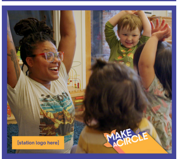
TUNE IN ON [BROADCAST DATE/TIME HERE]