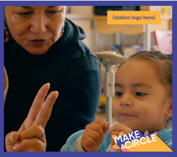
TUNE IN ON [BROADCAST DATE/TIME HERE]