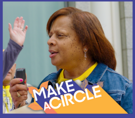
A NEW FILM ABOUT THE VALUE OF EARLY EDUCATORS AND A CHILD CARE SYSTEM IN CRISIS.